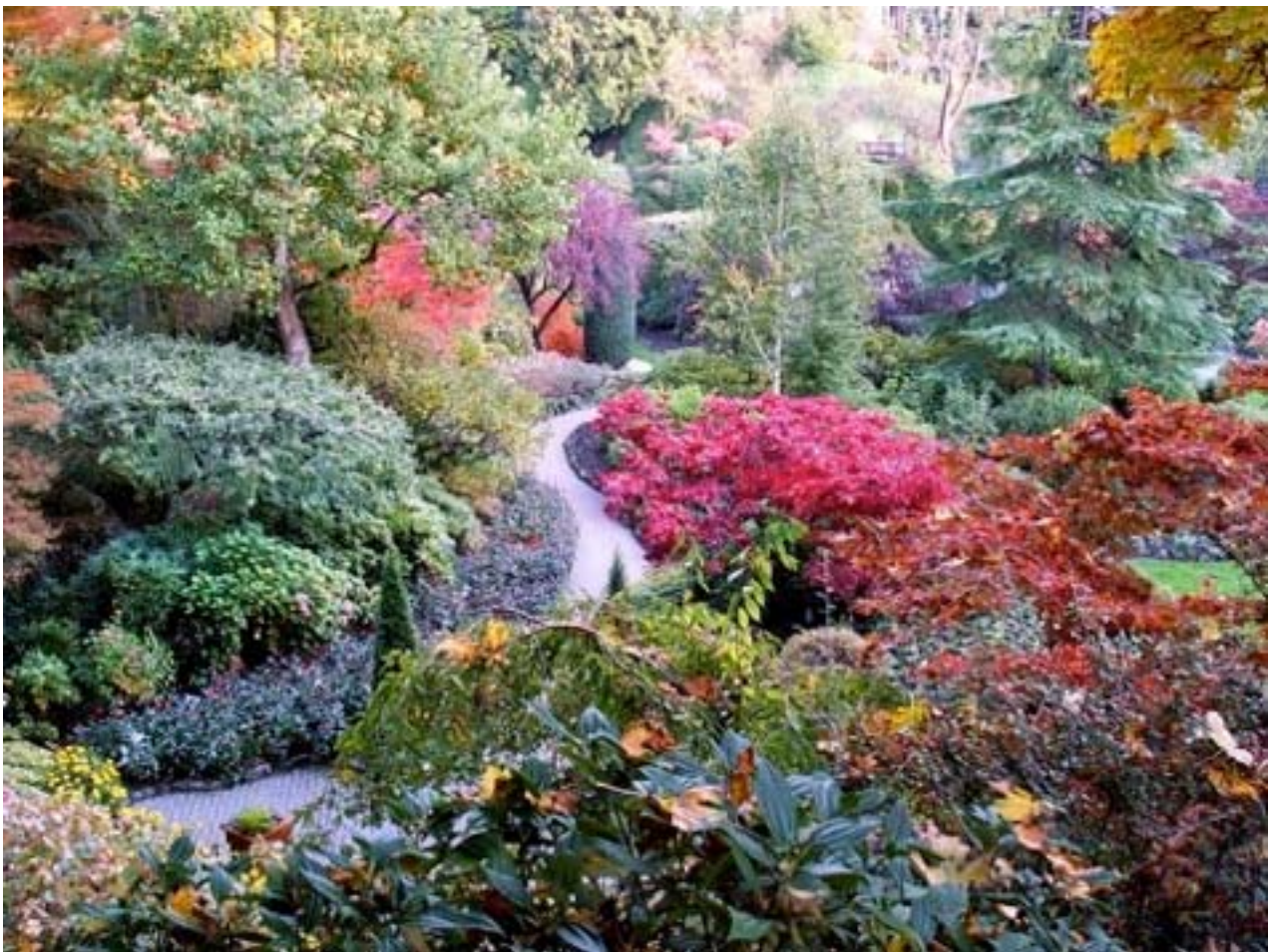
Butchart Gardens, Vancouver Island, Canada. October 2008.